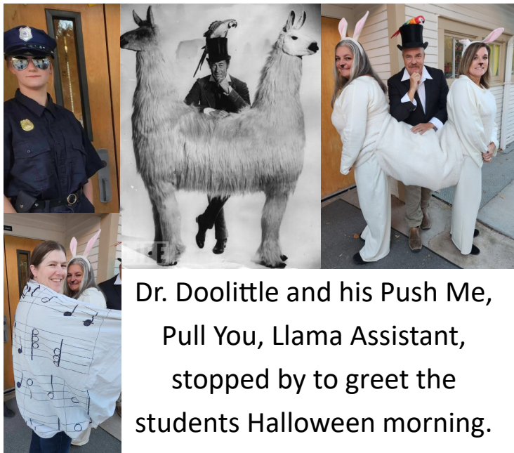
Dr. Doolittle and his Push Me, Pull You, Llama Assistant, stopped by to greet the students Halloween morning.